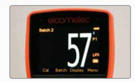
2.4" colour screen provides enhanced reading visibility at all angles