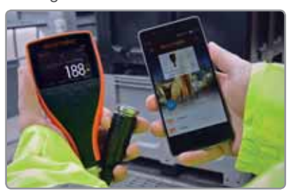
USB and Bluetooth<sup>®</sup> data output to iPhone or Android™ devices