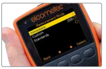
Range of Measurement Modes

Instantly transfer readings, statistics, and limits; via USB or Bluetooth®; to your PC or mobile device, using ElcoMaster® or your own software application, creating professional inspection reports in minutes.