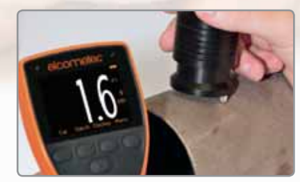
Integral or separate probes measure profiles up to 500µm (20mils)