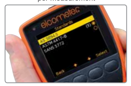
Can be used in accordance with a range of International Standards