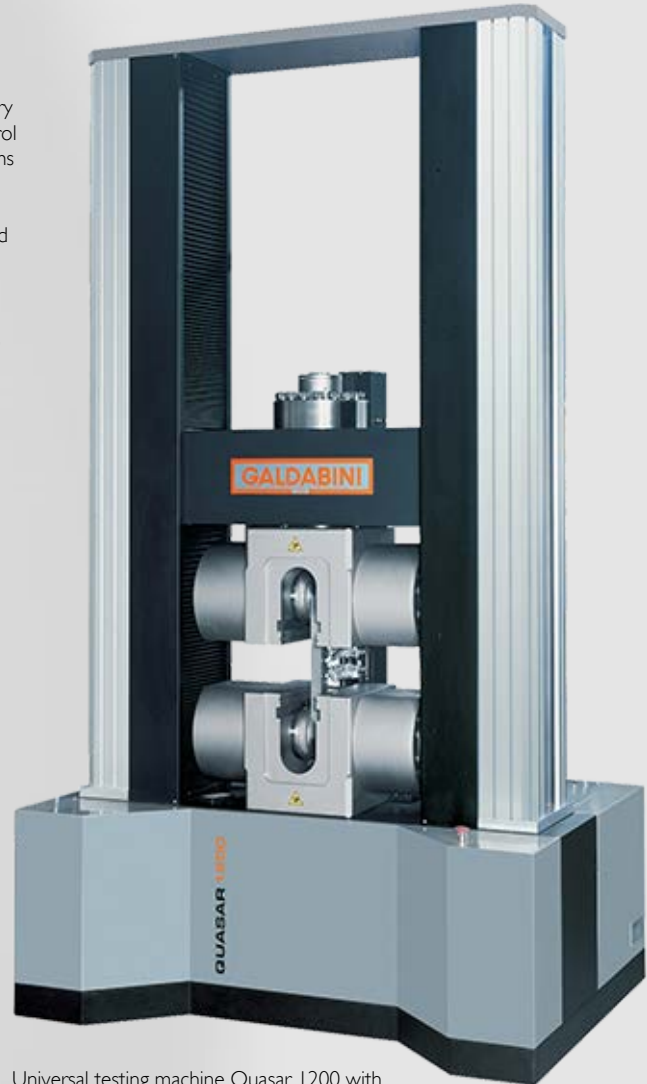
Universal testing machine Quasar 1200 with Hydraulic parallel closing grip and "Micron" extensometer

In addition, this user-friendly instrument can be fitted with additional load cells with lower capacities, providing the highest resolution and accuracy for micro-loads.