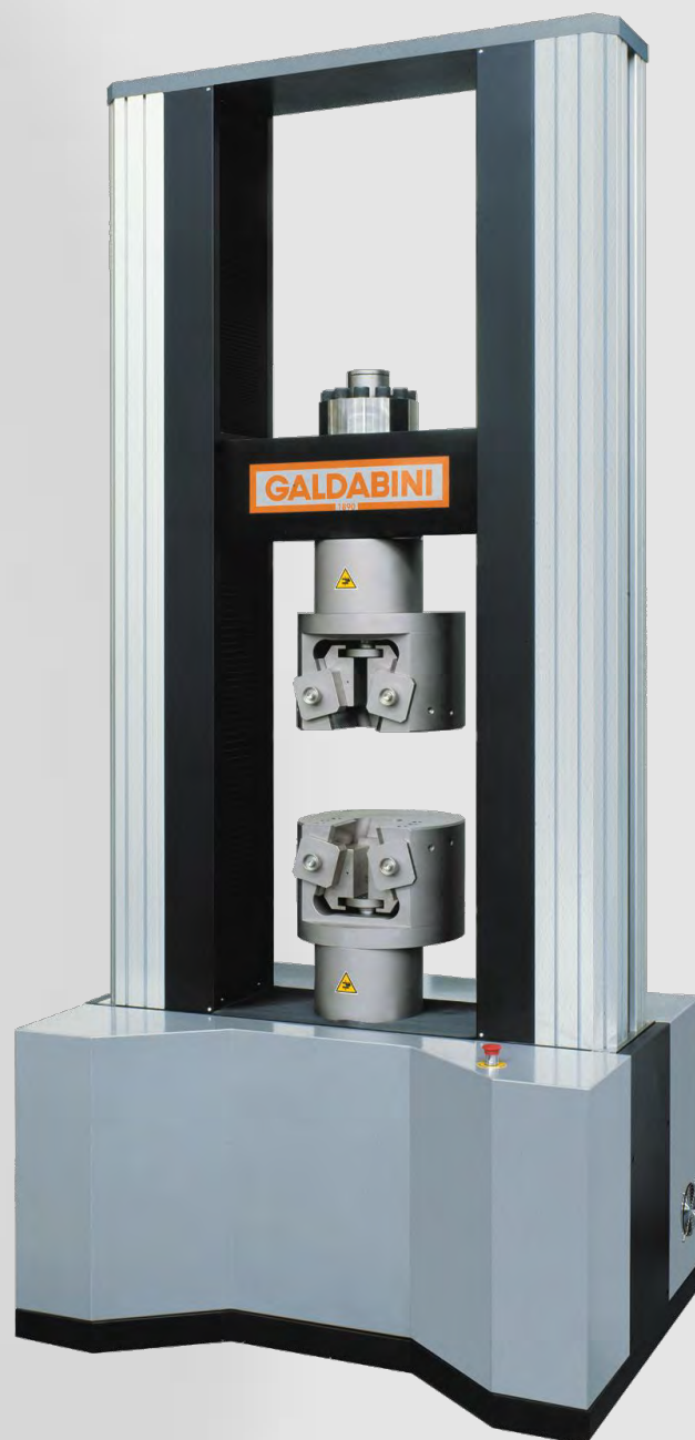
Universal testing machine Quasar 400 With pneumatic wedge grip