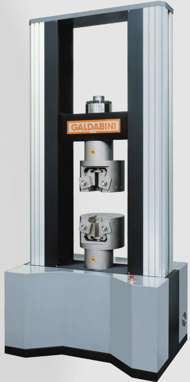
Universal testing machine Quasar 400 With pneumatic wedge grip