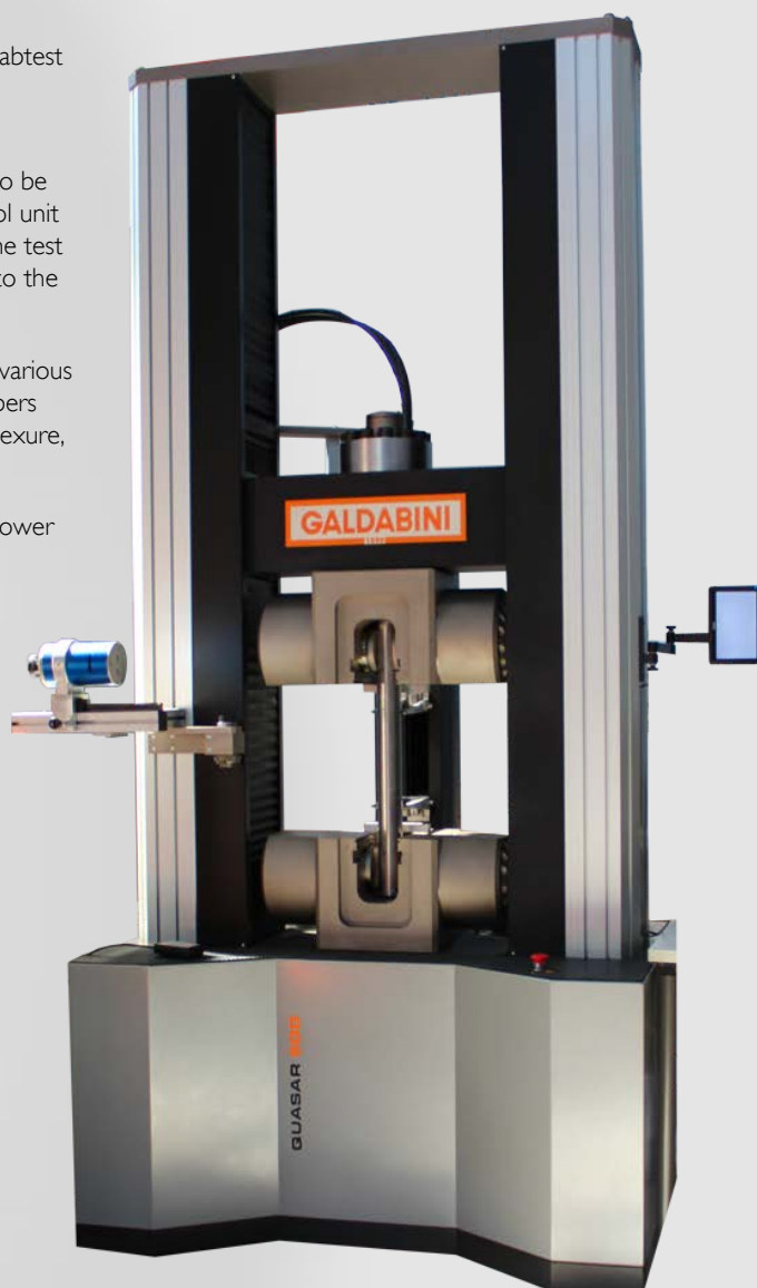
Universal testing machine Quasar 600 With hydraulic grip