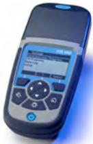
Turbidity Meters and Multiparameter Colorimeters