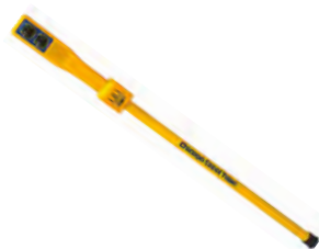
Metal Tracers and Locators