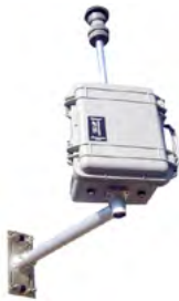
Portable Particulate Monitors