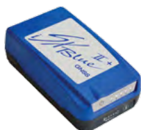
GPS & GNSS Receivers