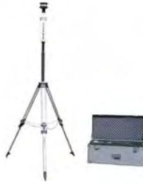
HAZMAT Weather Stations