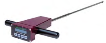
Soil Compaction Meter