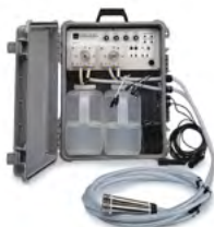
Automatic Water Samplers