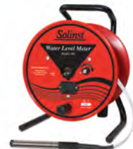
Water Level Indicators