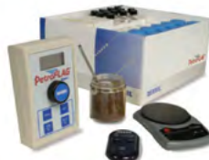
Hydrocarbon Test Kit for Soils