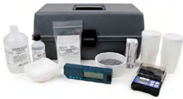
Soil Nitrate Quick Test Kits