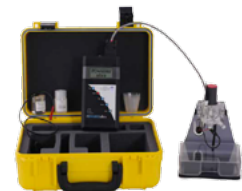
Portable Meters for Organic Analysis in the Field