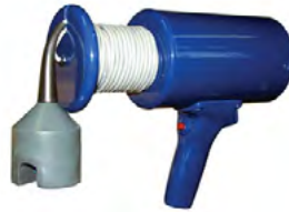
Sludge Interface Detectors