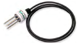
Wireless Data Loggers & Soil Moisture Sensors