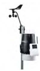
Weather Stations (Fixed or Portable)