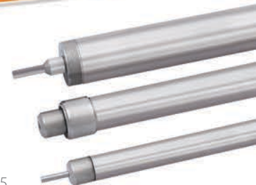
425 Discrete Interval Samplers

The 800 Low Pressure Packers are simple, inexpensive and inflate with a hand pump. They come as single or straddle packers and can be lowered into the well from a rope tether or a rigid PVC pipe. The 103 Tag Line can be used as a marked safety line. Available in sizes to fit wells and boreholes from 1.9" – 4.5" (48.3 – 114.3 mm) to a maximum pressure of 50 psi (345 kPa) for the smaller packer and 30 psi (205 kPa) for the larger packer.