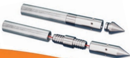
660 Drive-Point Profiler

The 660 Drive-Point Profiler allows collection of groundwater samples from multiple points, at discrete zones, in a single drive. This allows a detailed vertical profile with only one drive of the rig. The profiler tip is connected to a Peristaltic Pump which flushes the profiler tip with de-ionized water during driving to prevent cross contamination and is reversed to obtain a sample. It allows detailed plume delineation quickly and inexpensively. An expendable grout tip is available to allow easy decommissioning.