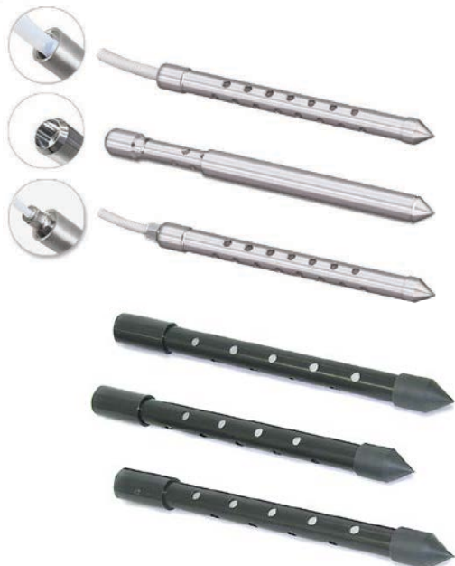
615 Drive-Point Piezometers