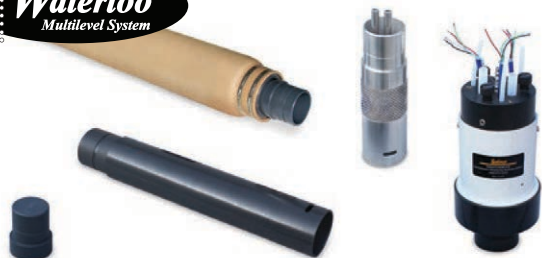
Standard Waterloo System Components, Including Packer, Port (Dual Stem), PVC Casing, PVC Base Plug, and Manifold

The 401 Waterloo Multilevel System allows detailed groundwater monitoring from many zones in one borehole.