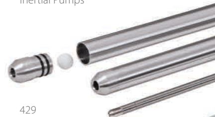
429 Point-Source Bailers