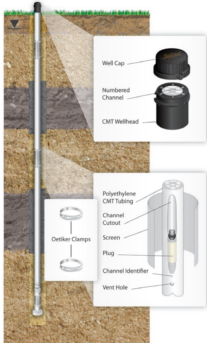
Typical 3 or 7-Channel CMT Installation using layers of bentonite and sand backfilled from surface.

Solinst offers CMT training that provides both instruction and hands-on demonstration for CMT construction and installation. Contractors who attend and complete the course are "Trained CMT Contractors" and can be listed on the Solinst website.